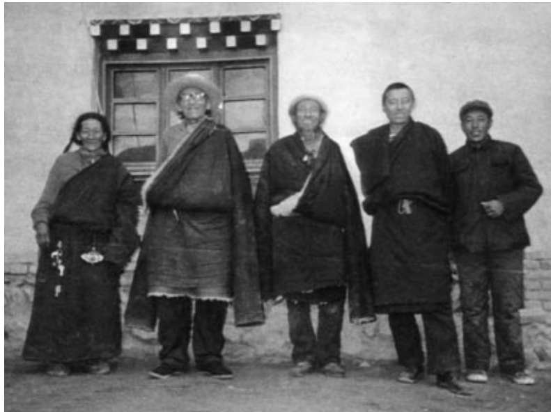
Didi's uncles and aunt, at their home in Tibet.

and spread it on the rice fields. However, there was a good side to the camp - it was like a university, due to the calibre of intellectuals in it! When things eased up in 1978, the Tibetan prisoners were allowed to return to Tibet and, as ex-nomads, were actually given back some of their land, a few animals, tents and money to start them off. They went back to their herding tradition and lived without interference. In fact, the erstwhile lords were given small pensions. Didi's oldest brother was not imprisoned like his father, but was in a sort of open