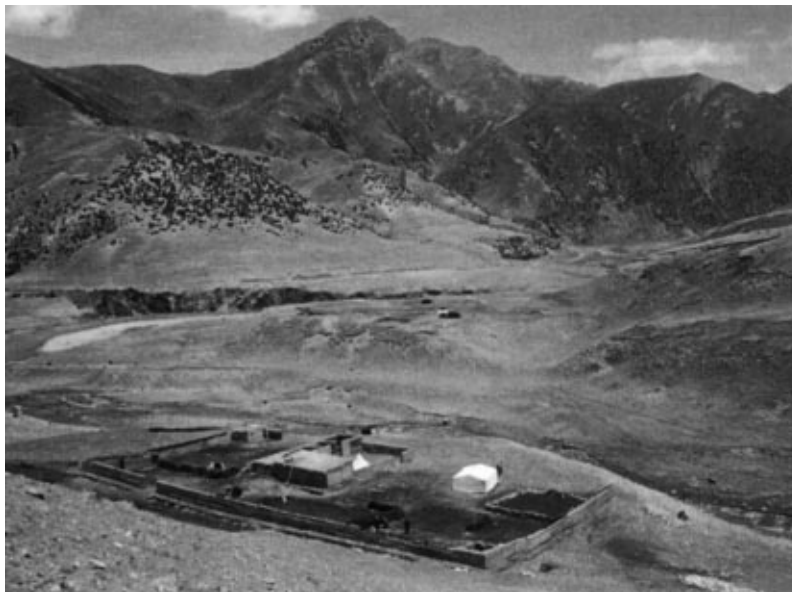
The compound of Didi's family in eastern Tibet.

In Tibet, the soul of the deceased is thought to stay in limbo for three days, then it goes into a state called "bardo", a kind of purgatory. If the soul can find its way, within 48 days it is reborn. During the bardo, the lamas and family call